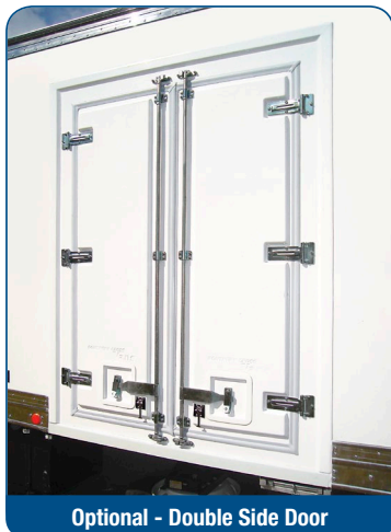
Optional - Double Side Door