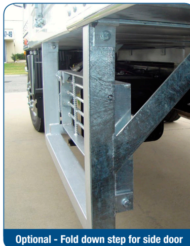
Optional - Fold down step for side door